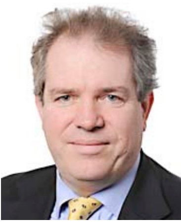
Charles TANNOCK (United Kingdom)

Member of the European Parliament - ECR Group; Member of the Committee on Foreign Affairs (AFET)