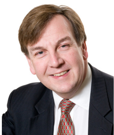
John WHITTINGDALE (United Kingdom)

Member of the British Parliament (Conservative Party/ ACRE); Chair of the British-Armenian All- Party Parliamentary Group