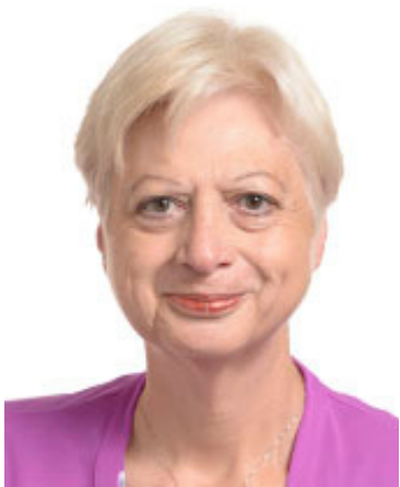
Eleni THEOCHAROUS (Cyprus)

Member of the European Parliament - ECR Group; Member of the Committee on Development (DEVE)